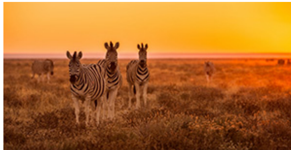
South African Photo Safari

RSVP here equusfoundation.org/wef For The Love of Horses!